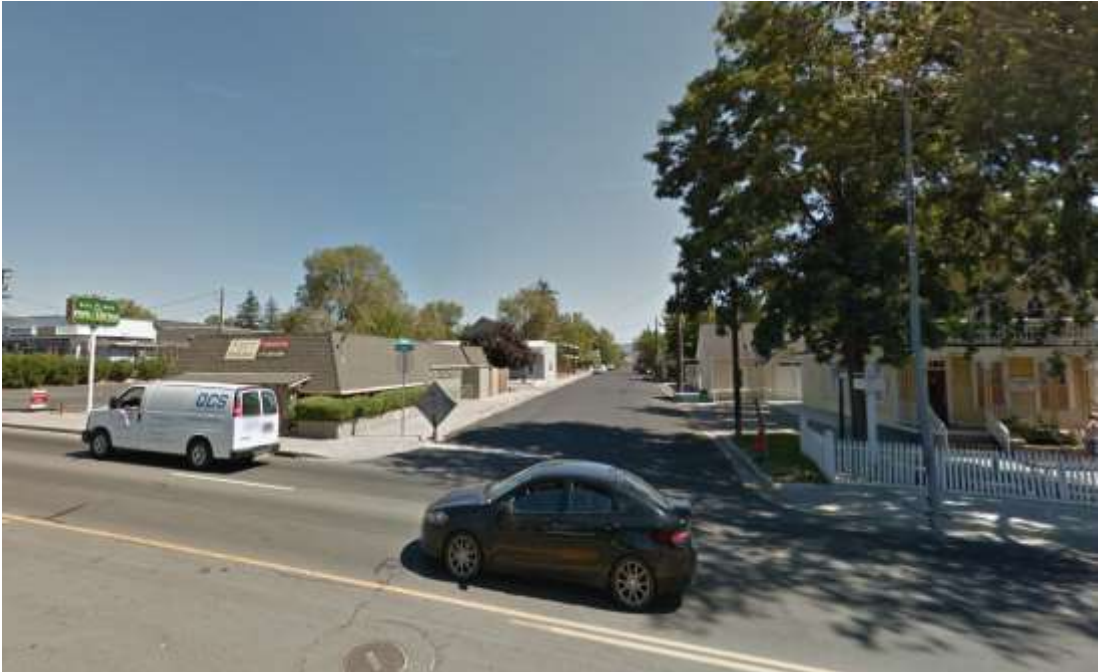
North Carson Street and Corbett Street