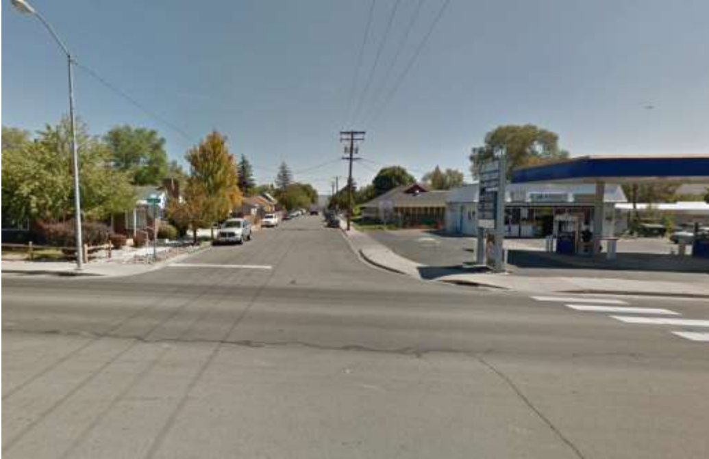
North Carson Street and Park Street