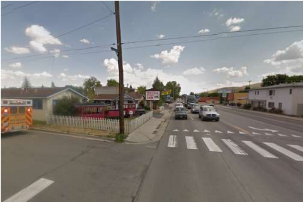
North Carson Street and Adams Street