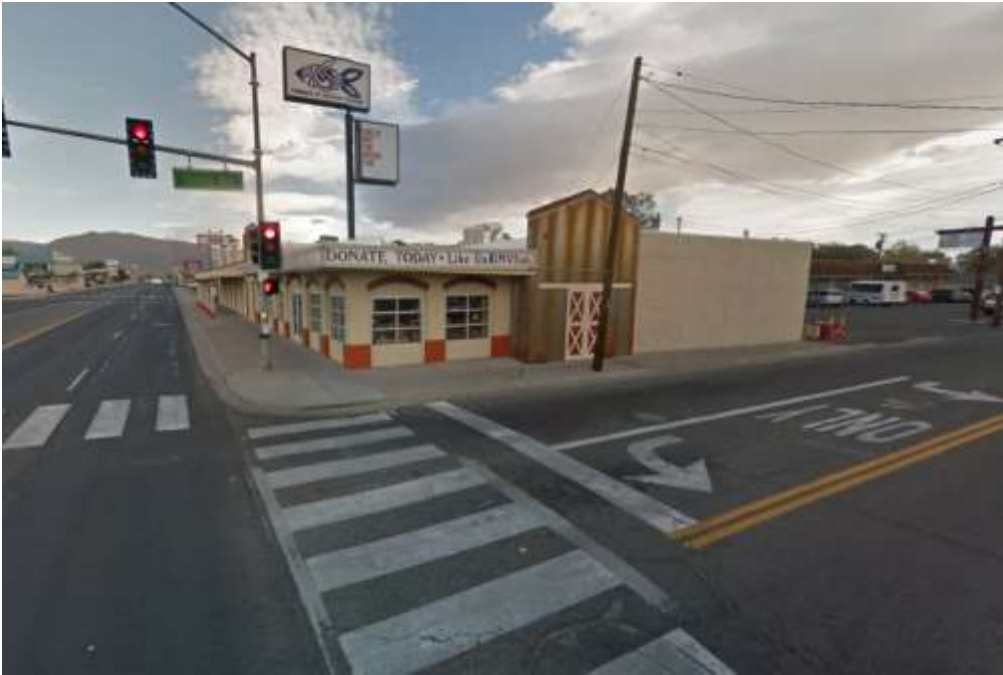
North Carson Street and Long Street