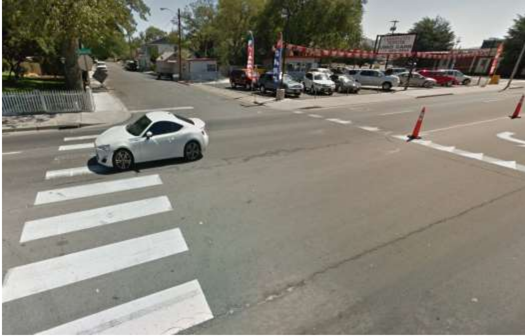
North Carson Street and Rice Street